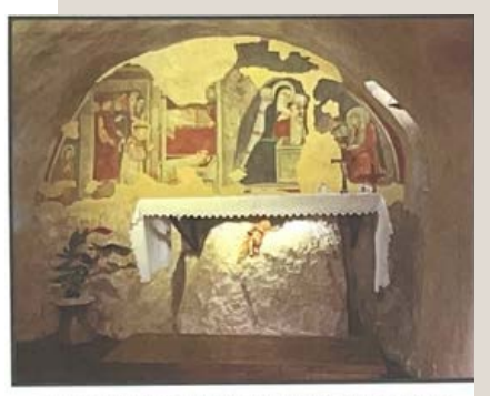
The grotto where the first nativity scene took place