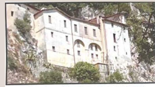
The hermitage of Greccio stands out prominently on the side of a cliff.

Next to the old church is a modern church with a display of hand-crafted creches along an upper corridor. Particularly striking are those from the school of Naples, known for a long tradition of artisanship and nativity scenes. The message is that the birth of Jesus was not an event that took place remotely in a faraway age and place; rather, our Savior is with us here and now.